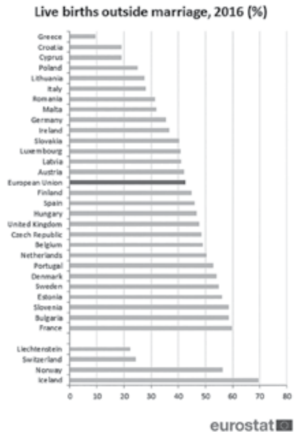
Figure 1 6

recent volume on the Irish family argues, of the tension 'between tradition, modernity and postmodernity'. 7 Working class families have long flouted conventional norms as regards marriage, not least because they could not afford to marry. In most capital cities in Europe in the mid 1900's, children born to non-married parents was a major phenomenon. No less than one third of all births in Paris, half in Vienna and more than two thirds in Klagenfurt (in what is now Austria) were out of wedlock. 8 That this may be surprising is indicative of the strength of the dominant ideology about the married couple family, and how misleading it can be.