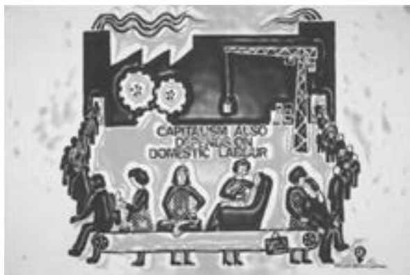
Figure 3 25

tech workers. Although for these workers, expectations may be higher, the trend today is that their pay falls increasingly into the bare necessities category, or less, and well below what they expected to get for the skills that they have paid to acquire. In the unequal and regressive capitalism of today, their salaries now barely allow them to rent a place, let alone buy one.