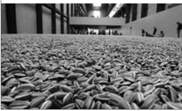
Ai Weiwei, Sunflower Seeds in Turbine Hall , 2010

plained. If the Tate Modern decides to commission a work for its Turbine Hall or hold a ‘blockbuster’ exhibition for a certain artist, this will undoubtedly boost that artist’s reputation. But why that artist is chosen and not another—why Ai Weiwei and not Tracey Emin, or why Joan Miró and not Salvador Dalí—need never be publicly articulated. Then there is the fact that the process is simultaneously national, continental, and global, with different judgments made at different levels. Jack Yeats is ‘big’ in Ireland, with a room dedicated to his work in the National Gallery, but he is little celebrated in Europe or the United States and almost unknown in India or China. Very few artists have generated truly global reputations, and, for obvious historical reasons, they have been overwhelmingly European