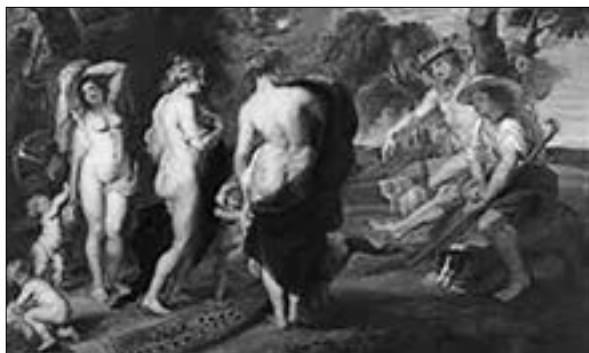
Peter Paul Rubens, The Judgment of Paris , 1636

nineteenth or even early twentieth century. Of course, the relationship between base and superstructure is not mechanical or automatic. As Engels put it: