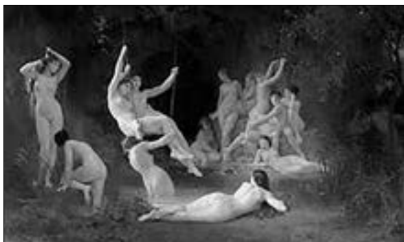
William Adolphe Bougureau, The Nymphs , 1878

judgments of quality. I will then look at what Marxism has to add to this conversation, in the process shifting from a consideration of how judgments are actually made to how I think they should be made.