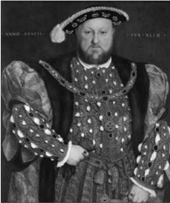
Hans Holbein , Henry VIII , 1540

the degree that, they give powerful and insightful expression to social relations and, especially, to new and changing social relations. Other criteria I have considered here – mimesis, technical skill, beauty, emotional power, realism and so on – are not negated or replaced by this criterion but subsumed under it. They become possible means—each important in its own right—to achieving a unity of content and form through which the powerful expression of social relations is achieved.