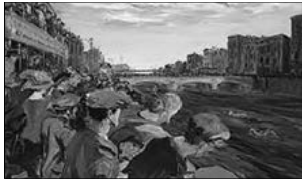
Jack Yeats, The Liffey Swim , 1921

When it comes to the operation of the art world today, 3 it is possible to identify the following actors in the formation of aesthetic judgments: critics (journalistic and academic), historians, museum and gallery direc-