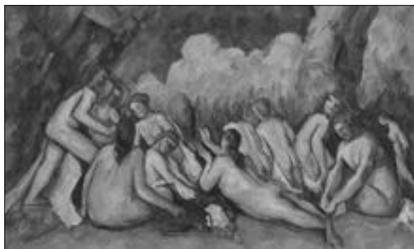
Paul Cezanne, Les Grandes Baigneuses , 1898-1905

It is widely assumed that Marxism advocates and