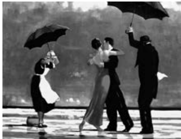
Jack Vettriano, The Singing Butler , 1992

Of the categories listed, the critics may appear to play the central role, especially because their judgments are public. But in my view their influence is generally overrated. Much more important are museum directors, dealers, and, above all, collectors: they have much greater institutional and economic power, and we should not ignore the extent to which the critics actually depend on them, economically and culturally, rather than shape them. Here we should note that most of the ruling