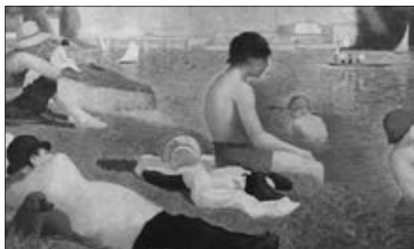
① Georges Seurat, Bathers at Asnières , 1884